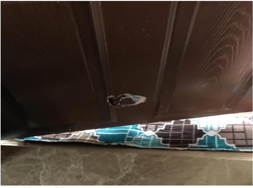
A room door in L.Ç's house