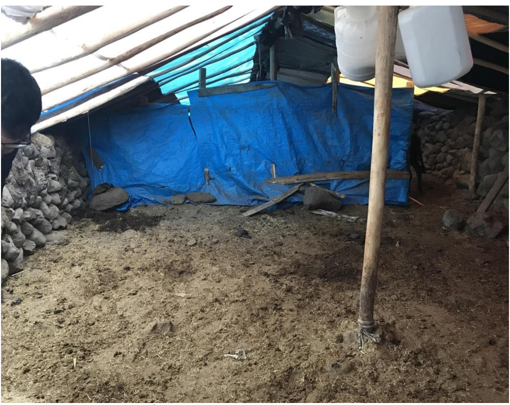
The interior of the barn where İ.Ç. was reportedly tortured.