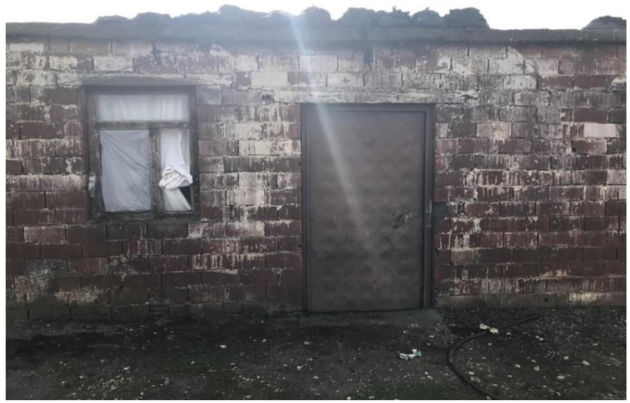
The damaged frontage of a house in Çakırtutmaz after raids.