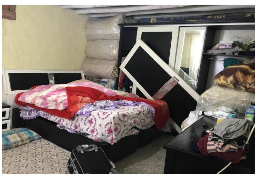
Inside of a house in Çakırtutmaz after house raids