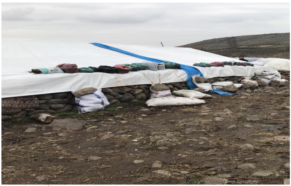
The barn where İ.Ç. was claimed to have been tortured.